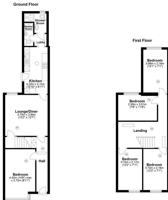
3 Manilla Rd, Selly Park, Birmingham